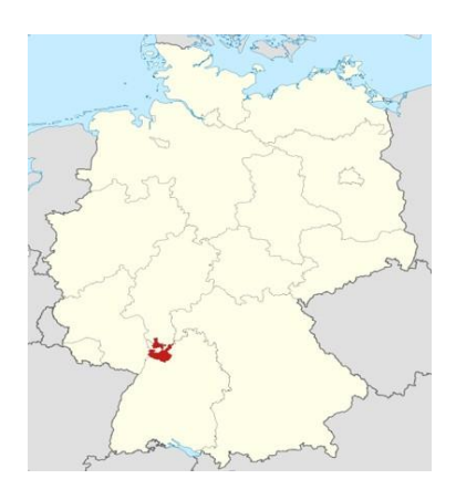
Germany and the Rhine-Neckar Metropolitan Area in the southwest