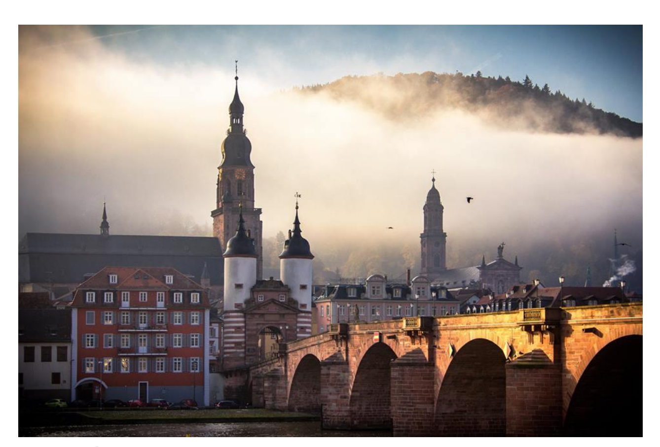
Heidelberg's "Old Bridge"

The City of Heidelberg: "Capital for Environment and Nature" an award-winning "Sustainable European Model City"